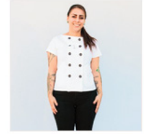
MOTHER TERESA Chef Coat