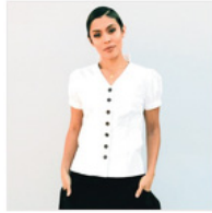
FRIDA Chef Coat