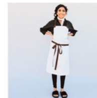
Athena Full Length Apron