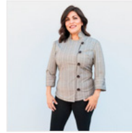
DURGA Chef Coat I Special Edition