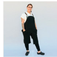
MARINA Overall Apron Split