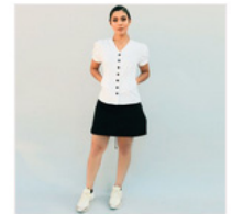
Athena Half Apron