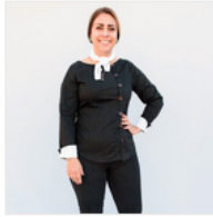
SOPHIA Chef Coat